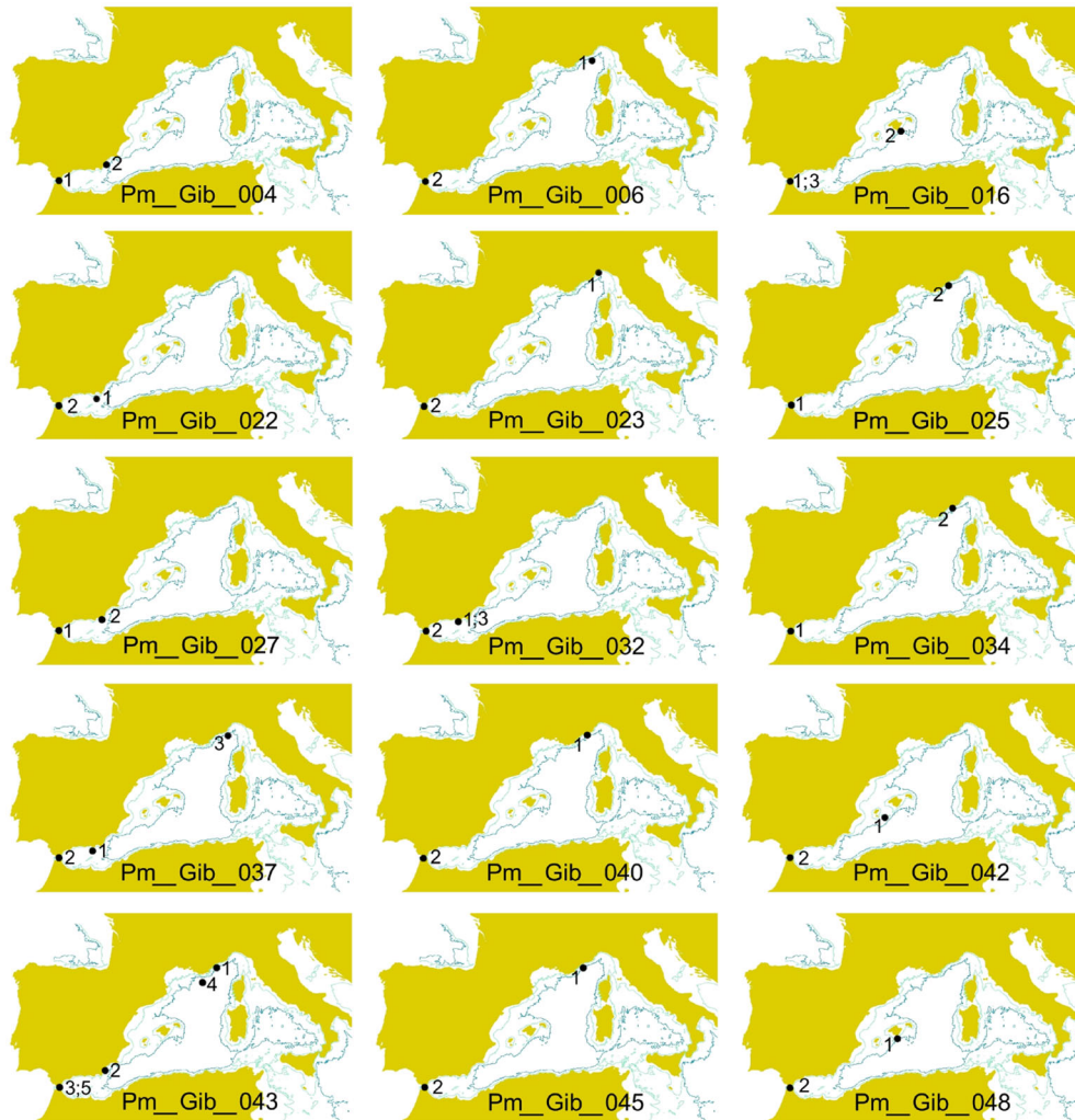
Figure 1. Individuals from the Strait of Gibraltar resighted in the Mediterranean Sea. Numbers indicate chronological order of observation.